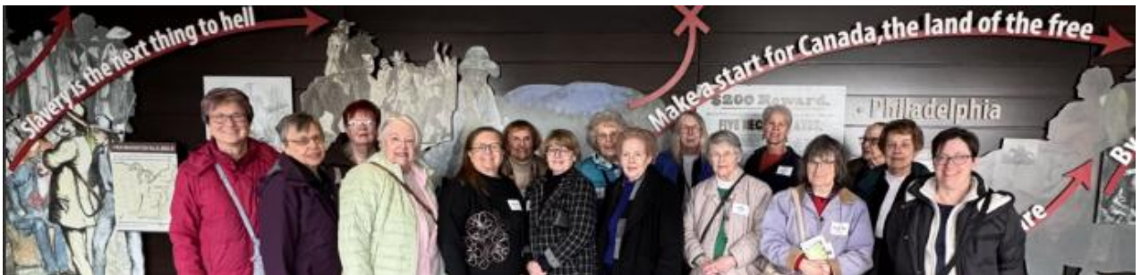
This group had an adventure touring the Niagara Falls Underground Railroad Museum