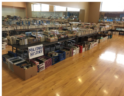
Pretty well set up!

tables, or any of the other myriad of valued tasks, we (and our more than 3,000 customers!) applaud you gratefully. We are still paying our expenses, but as of June 20th our gross income was $76,000 with a net of $47,000. Please check out our website Book Sale/AAUW