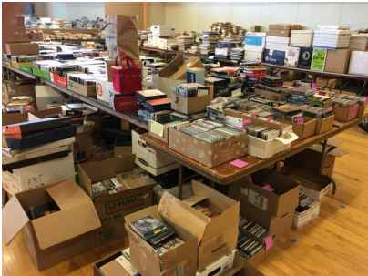
A daunting task ahead!

Many of our regular shoppers expressed to us how thrilled they were that we were back. We are a true WNY event. Our volunteers logged in 2,987 hours in pre-sorting, moving tasks, set up and cleanup plus 1,525 actual sale hours for a grand total of 4,433 hours (equal to 26.4 weeks) to secure scholarship dollars for WNY students. If you were a table chair, donated, sorted, cleaned, planned, set up, made signs, carried, cashiered, bagged, baked, loaned