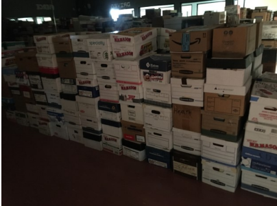
All those boxes from Calvary—three years of collecting!

This year our indefatigable Book Sale volunteers and WNY community came together to do the awe-inspiring and, at times, overwhelming, work of reestablishing our Annual Scholarship Book Sale after a two-year pandemic hiatus.