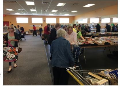
Every category was busy!

We are pleased to announce that we have already set our next sale in motion and have tentatively leased a new sorting site: 80 Earhart Drive, Suite 4, Amherst, in the Inducon Park building. We plan to be available for book drop-offs and sorting Tuesday and Wednesdays, 9am—1pm, starting September 27th and 28th. A signup form to supervise shifts (9-11 and 11-1) will be available on the Book Sale page of our website, aaubuffalo.org . Orange cones will reserve the parking spaces in front of the entry door for book delivery and we ask that sorters (we can't wait to see you all!) park in other available spaces—there are plenty! Many thanks to the staff at Calvary Episcopal Church for having supported us so kindly for so many years—we will miss you. Our Book Sale Executive Committee will miss Joan Kernan as she moves on to be with her family. We welcome Kate Collins, who has already been moving us ahead with actions and ideas.