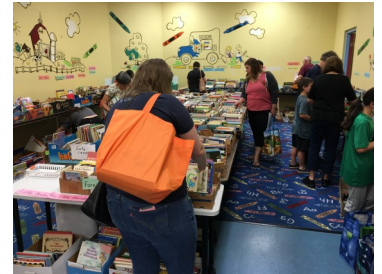
Children's Room—always crowded!!