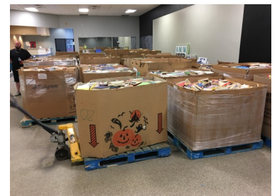
35 gaylords full of left-overs!