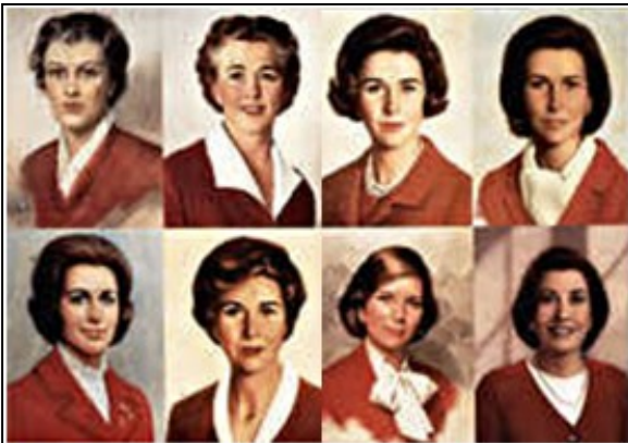
Betty Crocker over the years

Which one do you relate to? Learn about Betty Crocker, media icon, at our November 6 program!