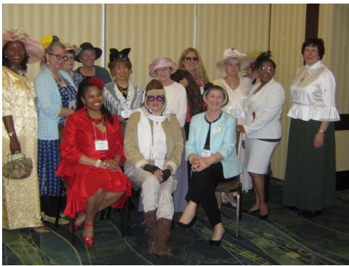
Above: Group photo with period dress on Friday night. Great fun! More Convention Photos —See page 7