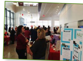
"Sit With Me"

This surely wraps up in one sentence the way I feel every year about this time in AAUW. March is a wonderfully busy month!! As I write this, we've been represented at the "Sit with Me" event at UB (encouraging women in computing careers) and the kickoff expo for Women's History Month at the downtown library. On International Women's Day we learned about the history and customs of tea as well as the progress (and lack thereof) in the National Park Service as far as women's history is concerned - while having a delicious assortment of tea sandwiches and desserts, by the way. We are represented on the Channel 7 "Aging is for Everyone" series. We have a booksale site!