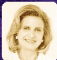
Congresswoman, NY Carolyn Maloney "The United States Congress and the Women's Rights Agenda"