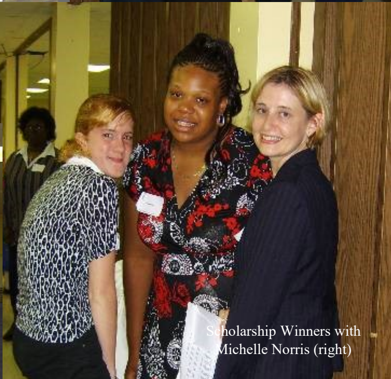
Scholarship Winners with Michelle Norris (right)