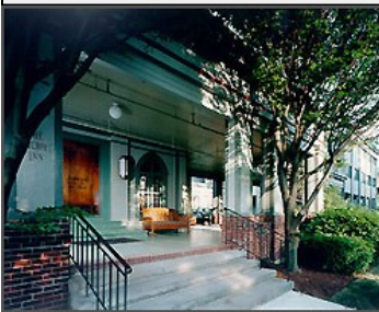
THE ROYCROFT INN

The deadline for each issue is the 10th of the previous month. Please send articles to Betty Preble via e-mail: betty6935@adelphia.net . Articles received after that will not appear in the next issue.