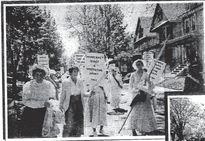
Members of the League of Women Voters dressed as suffragists, carry placards noting women's issues through the years