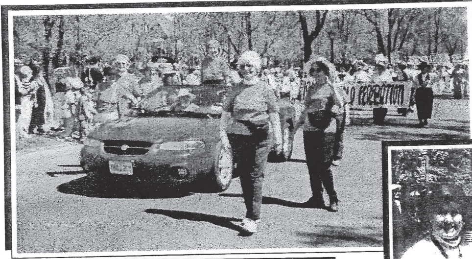
AAUW members march in Pan Am Parade